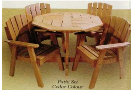
Patio Set Cedar Colour