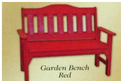
Garden Bench Red