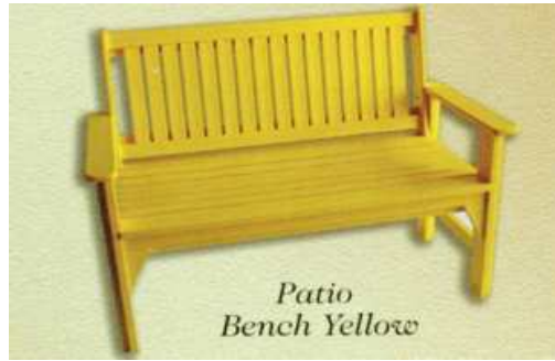
Patio Bench Yellow