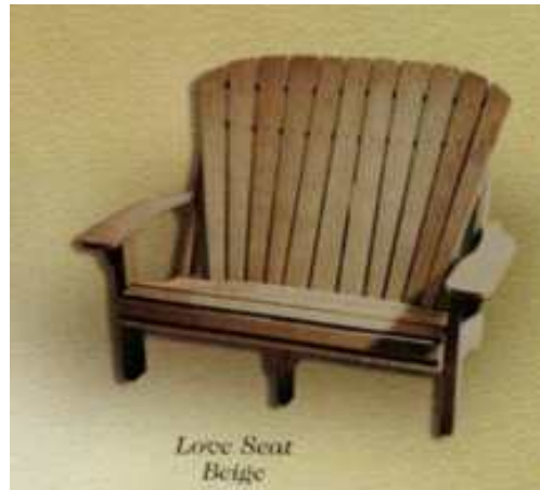
Louge Seat Beige