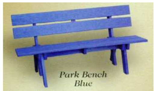
Park Bench Blue