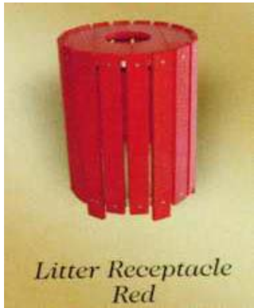
Litter Receptacle Red